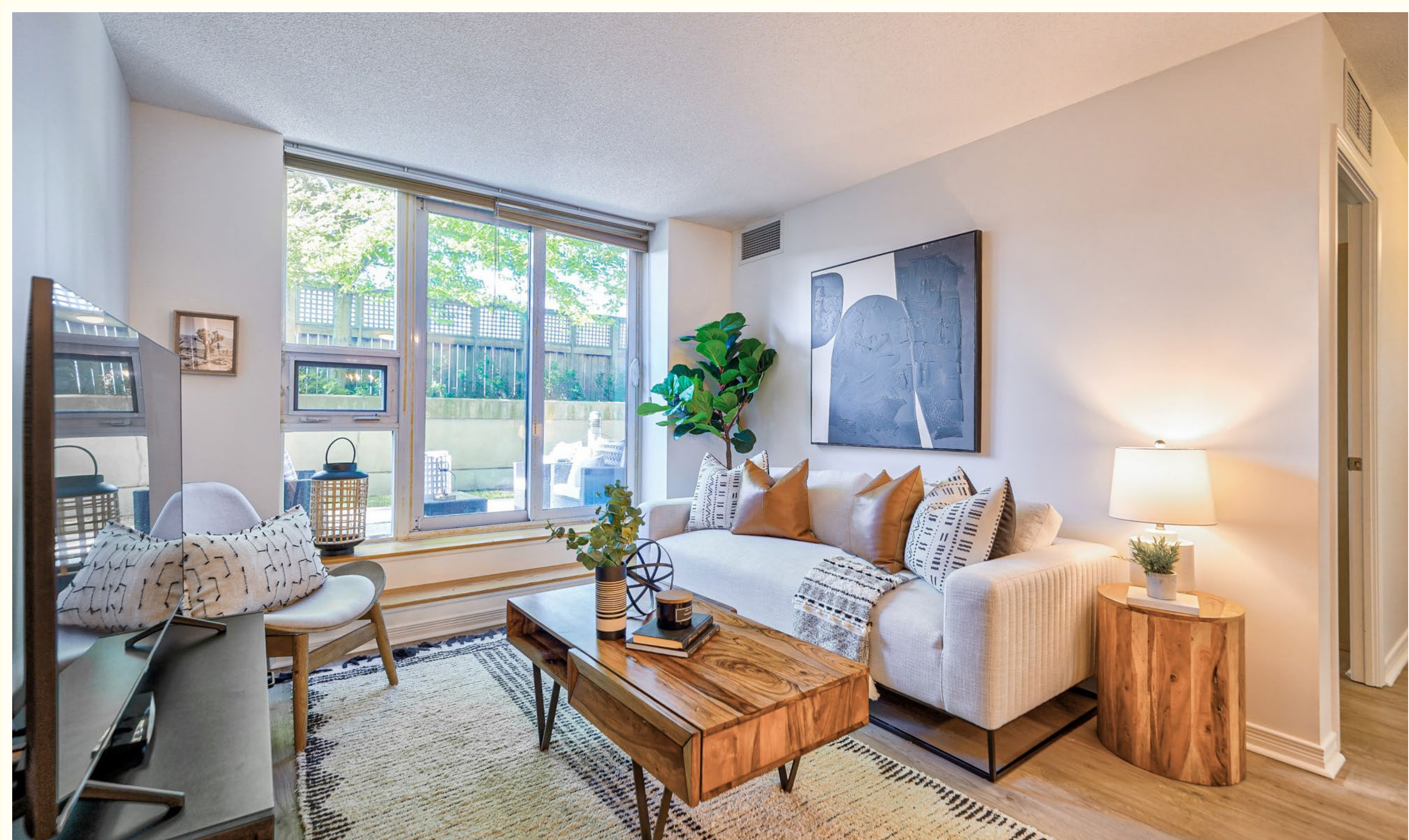
60 Heintzman St #431 Toronto